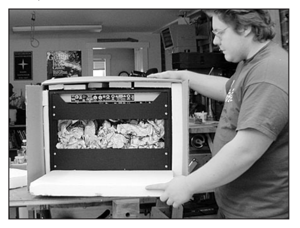
This amp's ready to go, protected inside and out. Tape the box with fiber-reinforced tape and call UPS.

Cut some styrofoam into snug-fitting pieces that fit the interior of the box exactly. I used 2" thick pieces for the front and back of the cabinet, and 1" thick pieces for the top, bottom and sides.